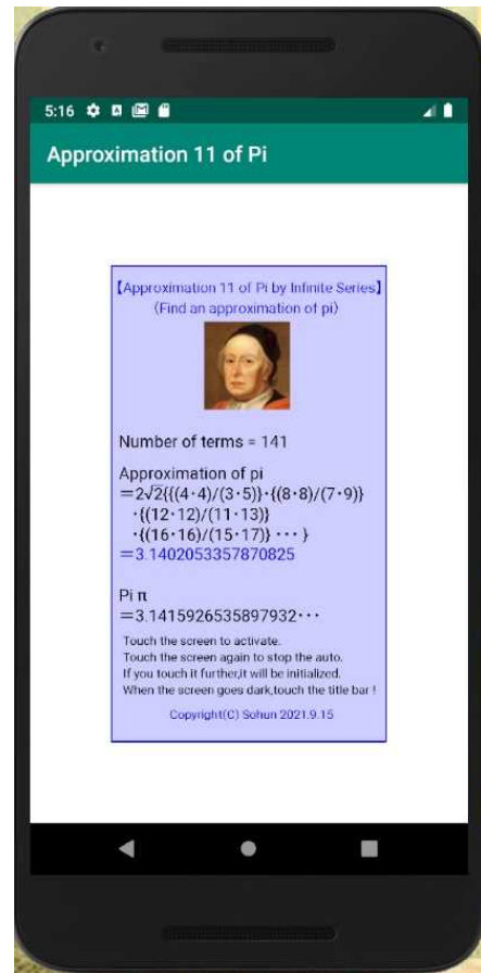
【Emulator image】 Android Studio Version 3.5.1